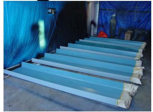
Before Coating ...

This was the result on ongoing problems on a high rise building that had leaks for years. The guttering was originally coated with Butynol and had been patched over and over with no success. New gutters were formed and coated with TUFF STUFF off site, fitted and the gutter seams then recoated with TUFF STUFF – no more leaking gutters.