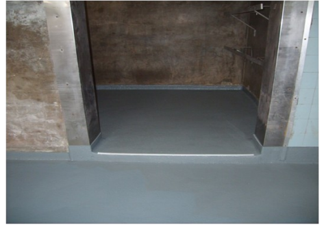
Processing area before preparation